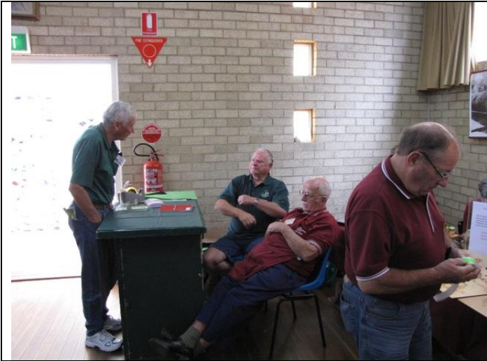
A few members have an in depth discussion?