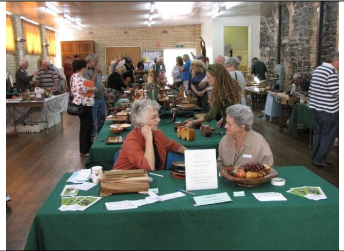
These two ladies were the real workers at the Expo!