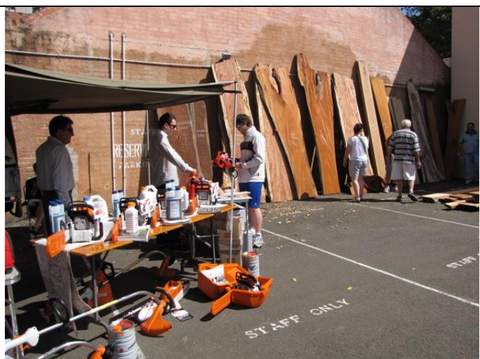
Edwards Chainsaws and the timber sales, a great combination